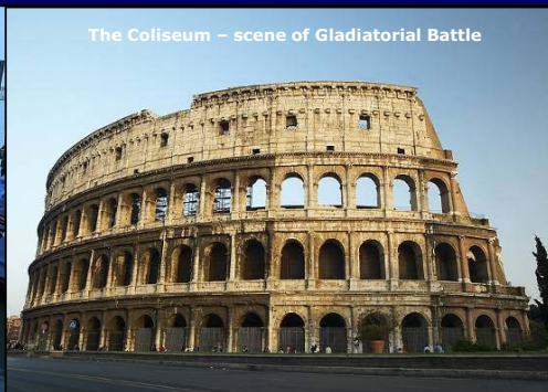
The Coliseum - scene of Gladiatorial Battle