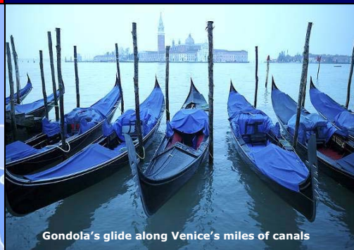
Gondola's glide along Venice's miles of canals