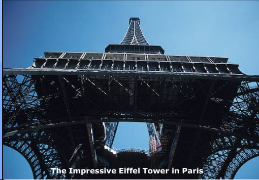
The Impressive Eiffel Tower in Paris