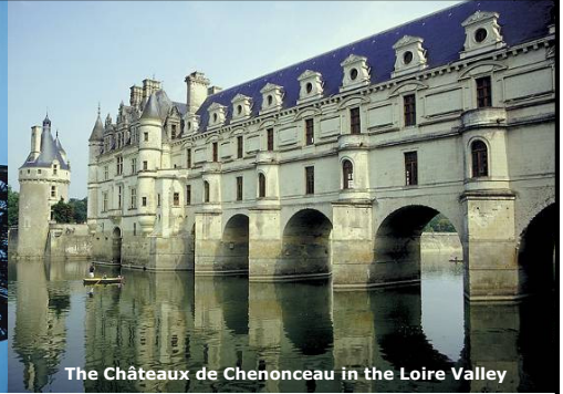
The Châteaux de Chenonceau in the Loire Valley